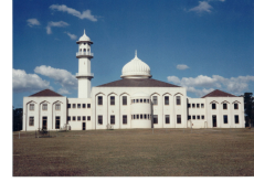
Al-Masjid Bait-ul-Huda, 20 Hollinsworth Road Marsden Park, NSW 2765, Australia